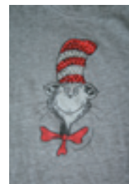
Women's Rhinestone Cat in the Hat Tee