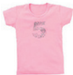
Rhinestone "5" Girls Shirt