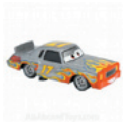
CARS Movie diecast cars

Check out these donated items from our VCC families on www.ebay.com/vcc . Bids are going on now!